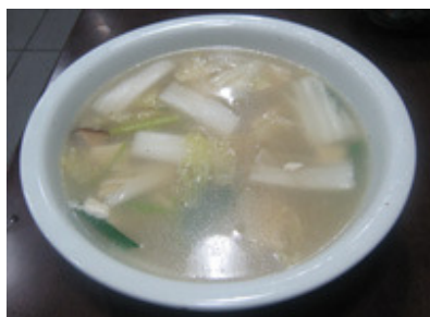
海蛎豆腐汤 hai3 li4 dou4 fu tang1

"West Lake Beef Soup" a thick beef soup with tofu and cilantro