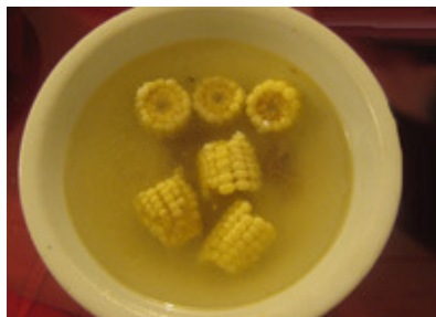
玉米汤 yu4 mi2 tang1