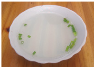
清汤 qing1 tang1

Take this guide into any Chinese restaurant and order by pointing to the Chinese characters next to the images. For more Chinese ordering guides, visit howtoorderchinesefood.com .