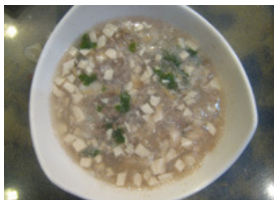
西湖牛肉羹 xi1 hu2 niu2 rou4 geng1

hot and sour soup; This common foreigner favorite is comes in many varieties: 酸辣肉片汤 suan4 la4 rou4 pian4 tang1 (pork) 酸辣肉皮汤 suan4 la4 rou1 pi2 tang1 (pork skin) 酸辣鱿鱼汤 suan4 la4 you2 yu2 tang1 (squid)