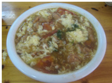
酸辣汤 suan1 la4 tang1

This is the most basic of all soups, usually consisting of no more than water, MSG, and spring onions. It is often served free of charge in cheap restaurants, and probably will not be of much appeal to most Western guests.